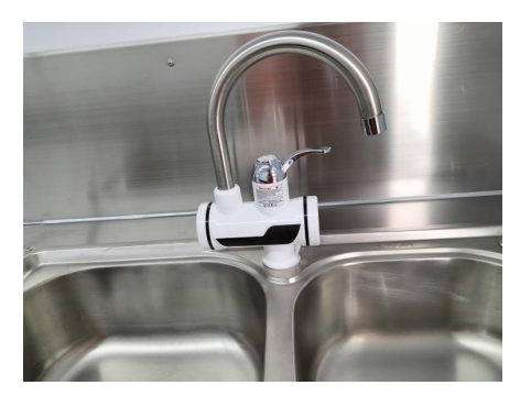
- Sink -