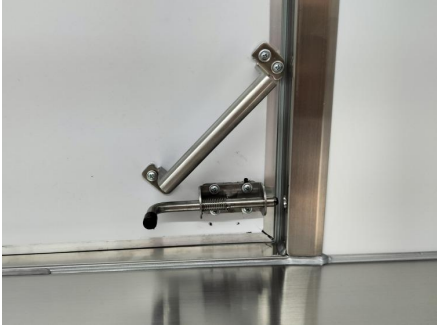
- Window bolt -